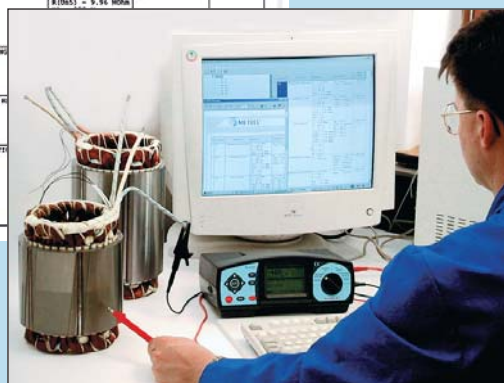
Diagnostic test of motor windings